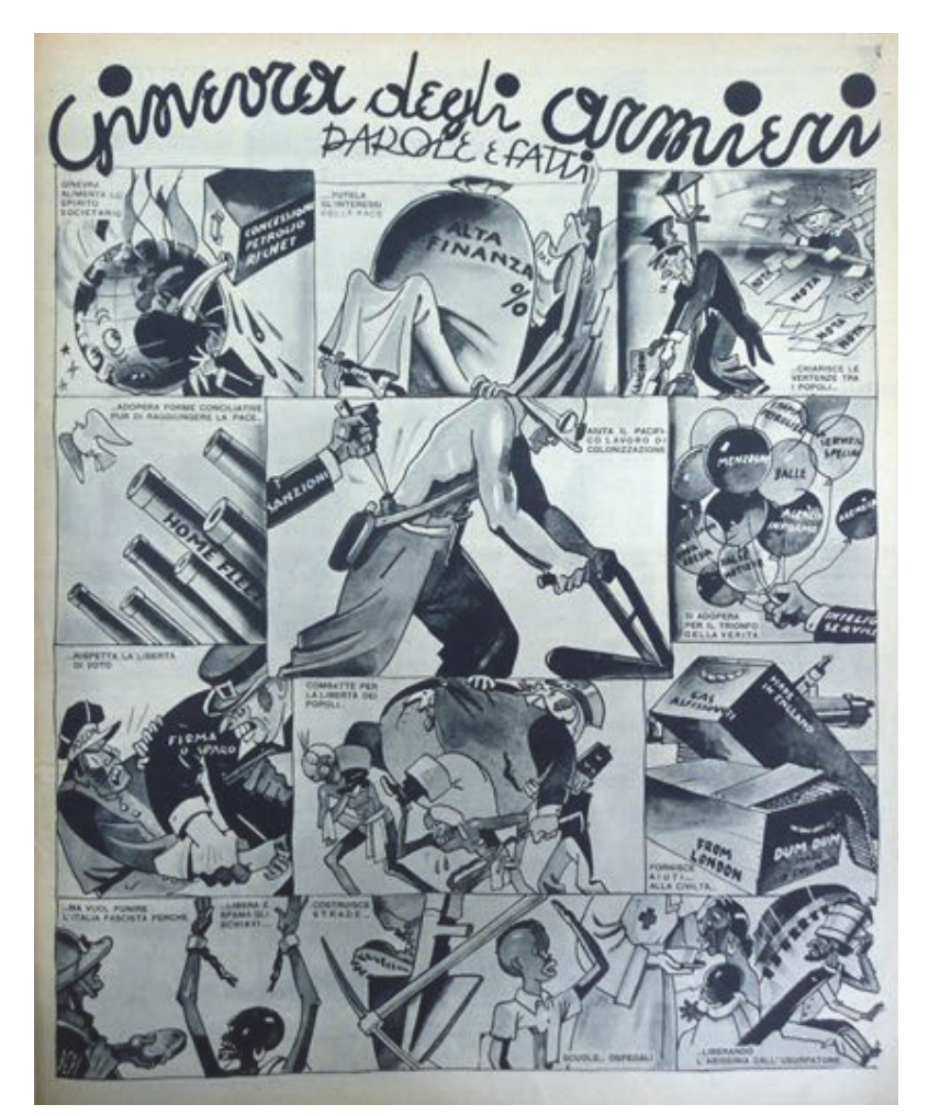
Fig. 11 – Ginevra degli armieri. Parole e fatti, Bepi [Giuseppe Fabiano?], «Gente Nostra. Illustrazione Fascista», 1935<sup>91</sup>

the context of the League of Nations querelle . It was necessary in order to argue that sanctions levied against Italy were not only unjust, but also unlawful and invalid. The allegation was that Italy had been unfairly punished by a hypocritical institution for doing nothing but defending itself and its interests in the colonies and 'doing' good, advancing civilization against barbarity. The illustration below (Fig. 11) synthetizes it quite well: