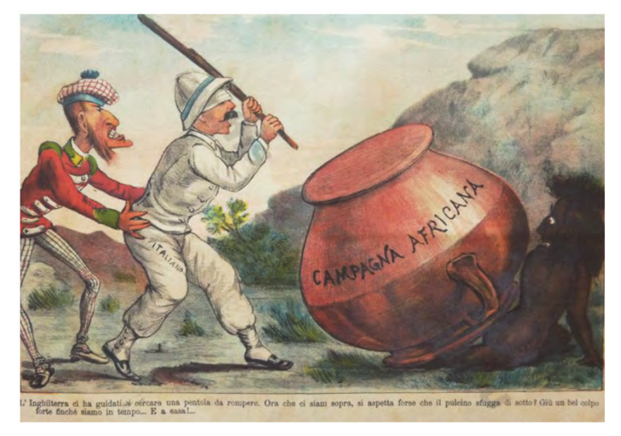
Fig. 4 – Un naufrago contemporaneo, «La Rana», 1888 ^{63}