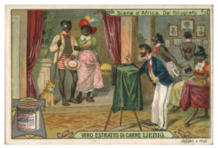
Fig. 6 - Dal fotografo, Scene d'Africa, Ed. italiana. Pubblicità Liebig, 1906<sup>75</sup>

tilts the attention of the viewer on the acquisition of Tripoli, which shares the same colours of the Italian peninsula. The connoted message hints at the expansion of the ('possessions' of the) State. There is no indication, either visual or textual, to any chance of betterment for the people of Lybia. The latter are completely obliterated; they do not even appear in the illustration.