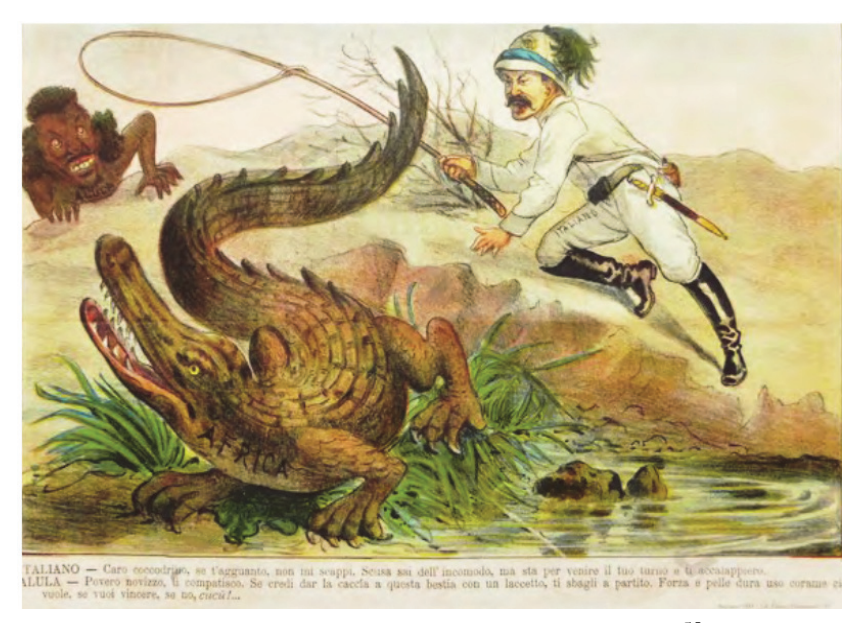
Fig. 3 – Un cacciatore novizio, «La Rana», 1888<sup>58</sup>

message is perfectly inscribed in the narrative above. The black character is depicted as a small generic beasty-like figure, respecting the racist canons of the time. More symbolically Africa is represented as a ferocious beast, the crocodile, which, on top of the lasso – the educational mission? – might need the intervention of the use of force to be definitively domesticated.