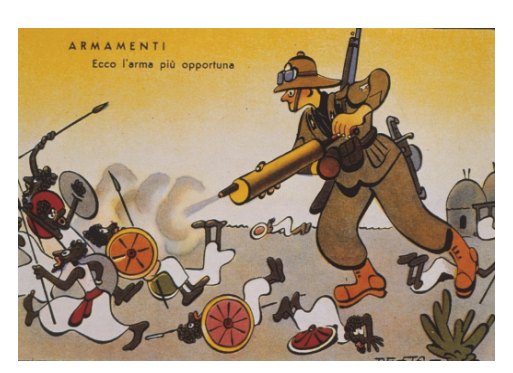
Fig. 9 – Armamenti, Postal card, E. De Seta, Edizione d'Arte Boeri, ca. 1935

While fascism was not very concerned with the structure and functioning of the international legal order and community at its advent, this changed with the Ethiopian War. A wave of criticism was addressed specifically against the League of Nations<sup>87</sup>. This organization was perceived as being unfit to advance the fascist model, which reflected a hierarchy of values and responsibilities, and the right to expansion of civilized nations. Per the reproval of fascist lawyers, the League – a democratic body based on unanimity and (artificial) equality among States – was inevitably flawed and subject to phenomena of clientelism. Its institutional structure would imply a de facto prevalence of a handful of powerful countries, who would orchestrate the decision-making process. This acrimony reached its peak when the dispute between Italy and Ethiopia was referred to the League and States decided to impose sanctions on Italy for the aggression and annexation of Ethiopia. The League – and several (foreign) scholars – specifically contested the violation on the part of