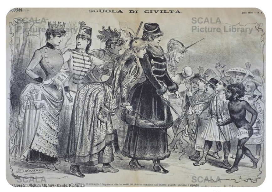
Fig. 5 – Scuola di civiltà, «Il Fischietto», 1886 ^{64}

<sup>63</sup> Sourced from Addisportals, Adwa Edition. Available at addis portals_Adwa.pdf.