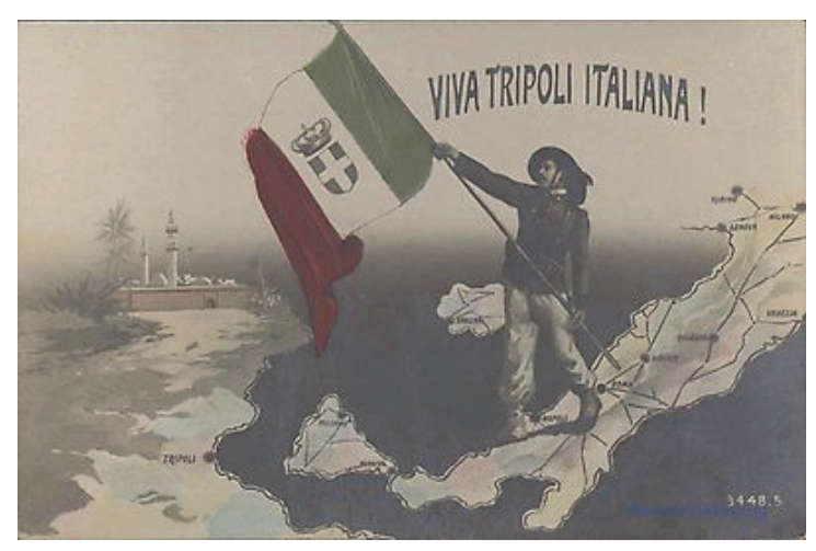
Fig. 7 - Celebratory card, ca. 1912 (author unknown)