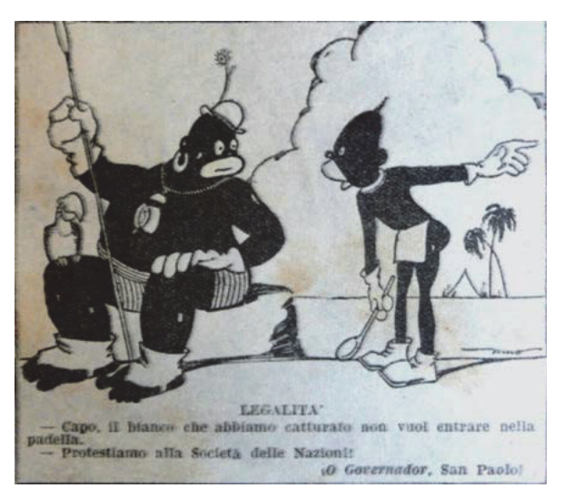
Fig. 10 - Legalità, «O Governador», San Paolo, «La Domenica del Corriere», 1935<sup>89</sup>

come meaningful members of the international community, yet they remain savages, a 'conglomerate of barbarians', certainly not States. In this sense, the cartoon exposes the flaws of the formal equality paradigm within the League of Nations, but also the possibility for inferior populations to access the League without fulfilling the criteria of statehood. Membership in the League allows 'savages' to employ its institutional mechanisms for redress, which comes across as illogical and ridiculous. As the vignette hints at, a formalistic approach to legality results in absurd conclusions, since it would grant Africans the possibility to protest at the League to defend their right to anthropophagy, to defend their 'right to barbarity'.