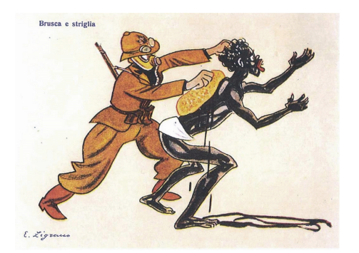
Fig. 8 – Brusca e Striglia , Postal Card, E. Ligrano, Arti Grafiche Minarelli, 1935

that shapeless agglomeration of barbarians, which had usurped the title of State, has been subject to a true debellatio [...]. This way of ending the war, which reveals its Roman influence even in its Latin name, appears to be the most politically appropriate and in keeping with the attitude of Fascist Italy [...]<sup>86</sup>.